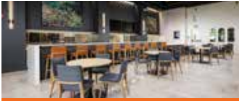
Financial Office, Downtown Pittsburgh