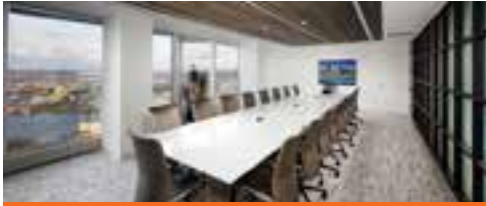
Law Firm, Downtown Pittsburgh