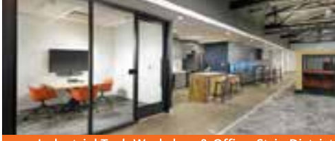
Industrial Tech Workshop & Office, Strip District