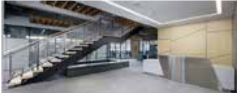
Global HQ Office, Strip District