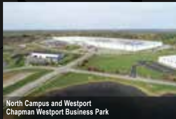
North Campus and Westport Chapman Westport Business Park