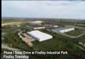
Phase I Solar Drive at Findlay Industrial Park Findlay Township

Branch Offices: Albion, Greensburg, Center, Harmar, Kittanning, Washington, White Oak, PA and Dublin, OH